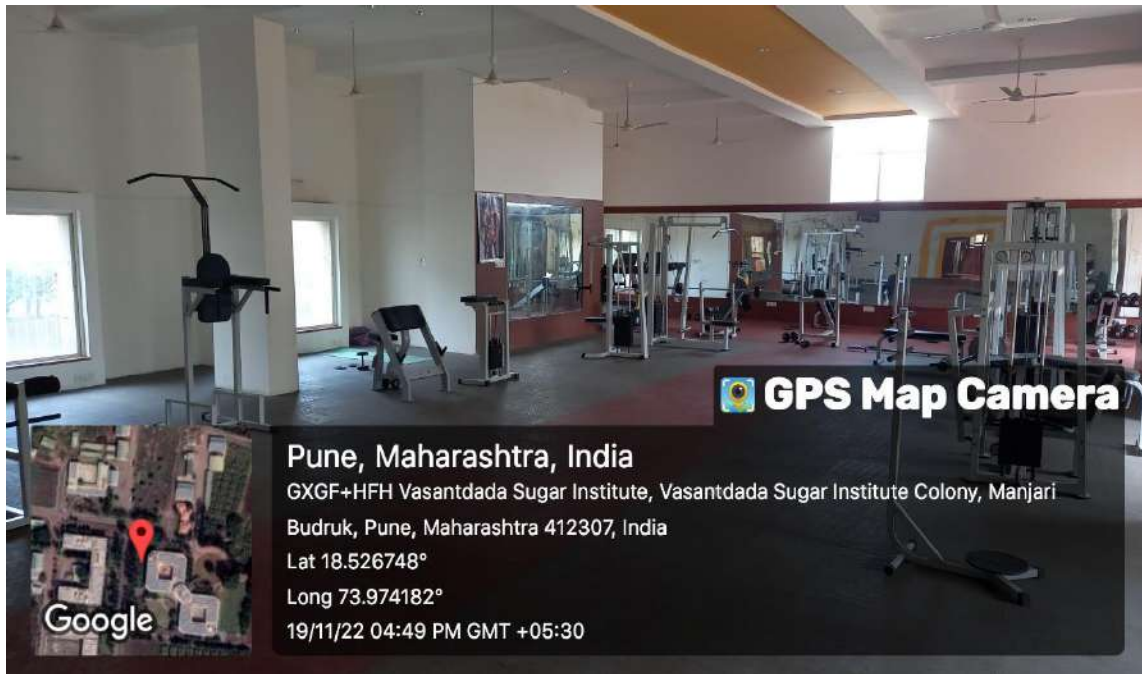
Figure: Gymnasium facilities