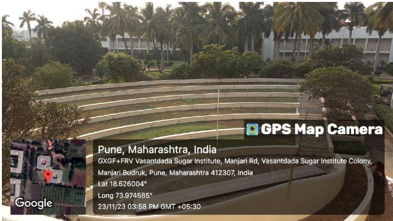
Figure: Open Amphitheatre for programs