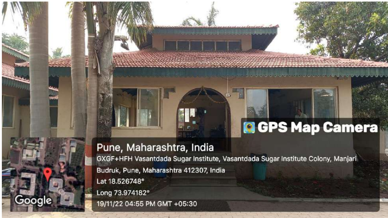
Figure: VSI Canteen