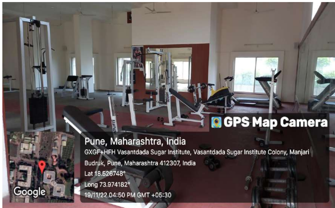
Figure: Gymnasium facilities